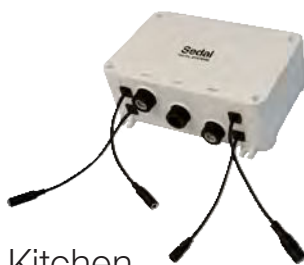
T1 Kitchen Electronic Water Valve