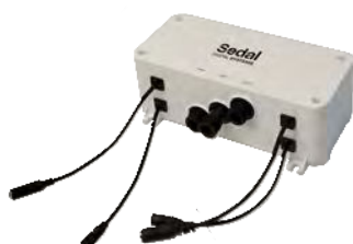
M1 Kitchen Electronic Water Valve