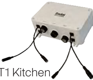
T1 Kitchen Electronic Water Valve