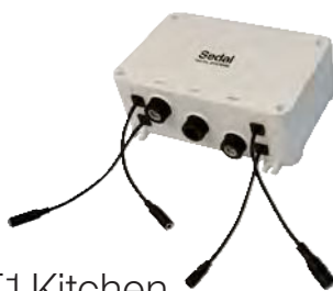
T1 Kitchen Electronic Water Valve