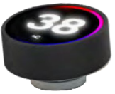
Rotating knob with screen